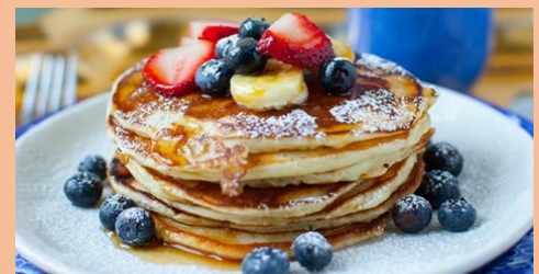
Pancake & Prayer Breakfast

THIS WILL BE TO VOTE ON THE NEW ROOF AND EXTERIOR PAINTING OF THE SANCTUARY ONLY. PLEASE BE IN ATTENDANCE IF POSSIBLE.